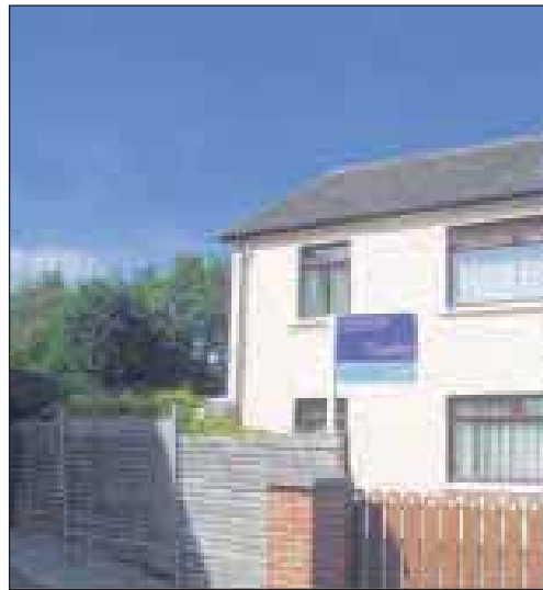
City slicker: a family home in Belfast