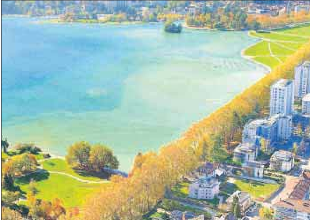
La belle France: a landmark development of luxury apartments