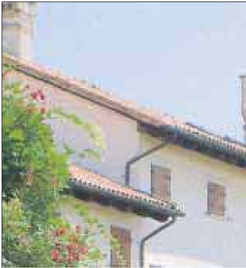
Par excellence: golfers love Italy