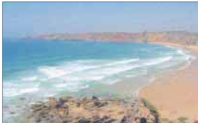
Viva Espana: village resort outside Malaga